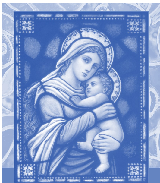
Mary, the Holy Mother of God

The reforms of the Vatican II returned the day to Mary, Mother of God but kept the Gospel reading which refers to Jesus’ circumcision.