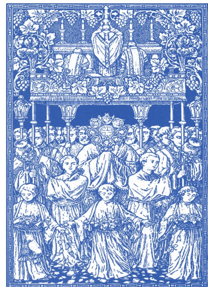
The Most Holy Sacrament