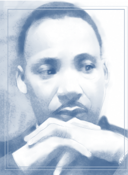
Martin Luther King, Jr. Day

MLK Holiday Monday, January 21 Mass at 8:30 AM