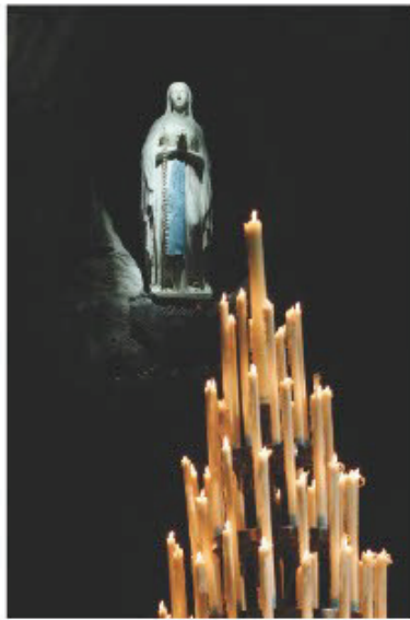
Candles burn in front of the statue of Mary at the grotto at the Shrine of Our Lady of Lourdes in southwestern France.

St. Bernadette's accounts of seeing a heavenly vision of