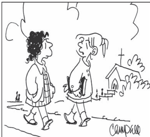
"Because he works from home. That's why we never see God in person."